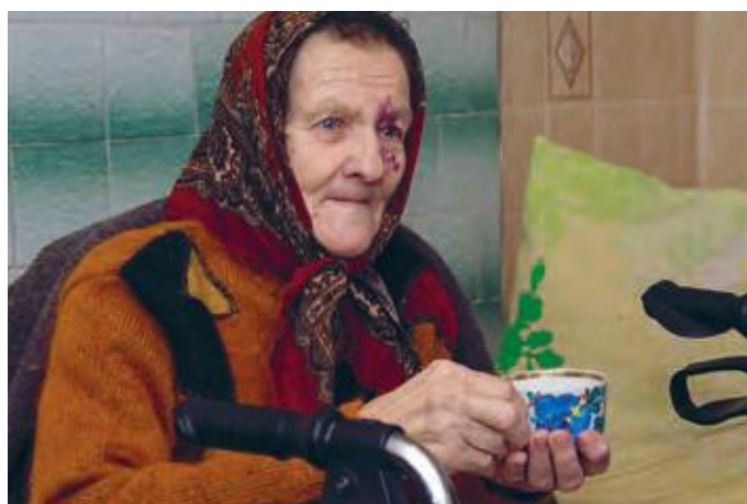
Kovalenko Konstantin/HelpAge International (Ukraine)

Although, some older people said there were one or two palliative care services available to them, such as pain relief, spiritual support, counselling, medication for chronic diseases, massage and support with personal hygiene. However their responses suggested a lack of a comprehensive system.