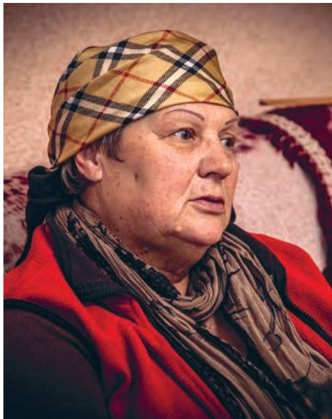
Ermishin Oleg/HelpAge International (Ukraine)

These rights to autonomy, independence and legal capacity in older age are not clearly articulated in international human rights law and need to be included in a new UN convention on the rights of older people.