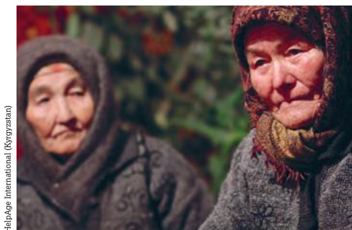
HelpAge International (Kyrgyzstan)